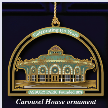
Carousel House ornament

In the works as this newsletter goes to press...and scheduled to go on sale in September 2022... our all-new 2023 wall calendar Soundings from Asbury Park celebrates the amazing century-and-a-half soundtrack to our little but LOUD Music City by the Sea!